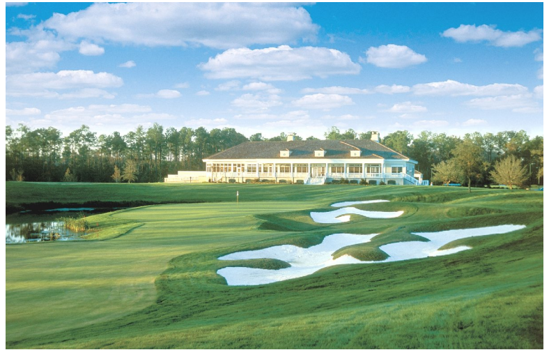
TPC Myrtle Beach