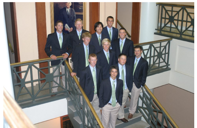
The 2009-2010 Coastal Golf Team will serve as camp counselors