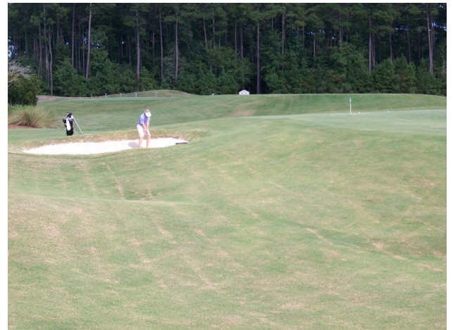
Private Practice Facility